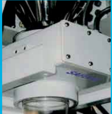
PowerPhasePRO Metal Detection Increasing Productivity Reducing Costs Improving Competitiveness