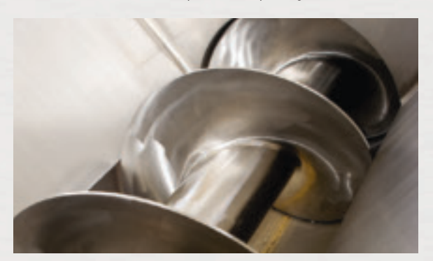
Polished food contact surfaces